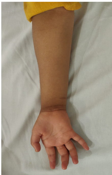
Figure 1: Wasting of hypothenar muscles of the right hand and complete claw hand.

On flexion imaging, there is anterior displacement of posterior dura with enlarged posterior epidural space (extends from the level of C 4 to C 7 vertebrae for a maximum length of ~5.4 cm and maximum thickness of ~4.8 mm) showing epidural flow voids. There is atrophy of lower cervical spinal cord, with associated intramedullary T2WI/ STIR hyperintensity involving the anterior horn of the spinal cord extending from C 4 to C 7 vertebrae. At all vertebral levels, mild diffuse disc bulge indenting the anterior thecal sac was seen, not resulting in neural foraminal narrowing.